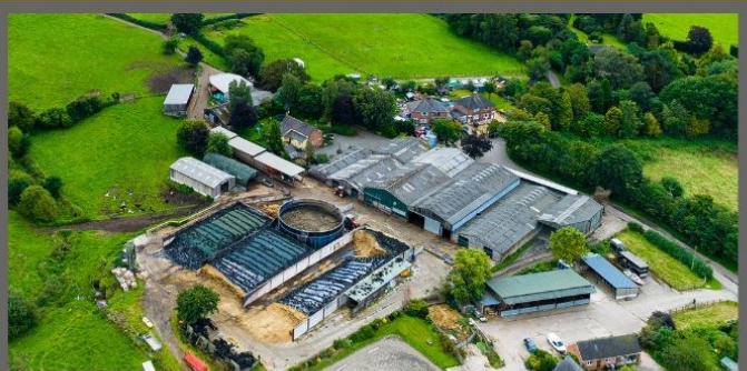
151.03 Acres Nantwich, Cheshire Well-equipped dairy farm | EPC E O.I.E.O £2,500,000