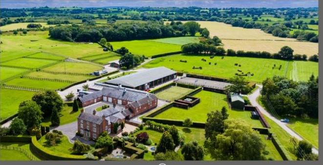
189.21 Acres ○ Nantwich, Cheshire World class equestrian estate | EPC's C-E Guide Price £6,250,000