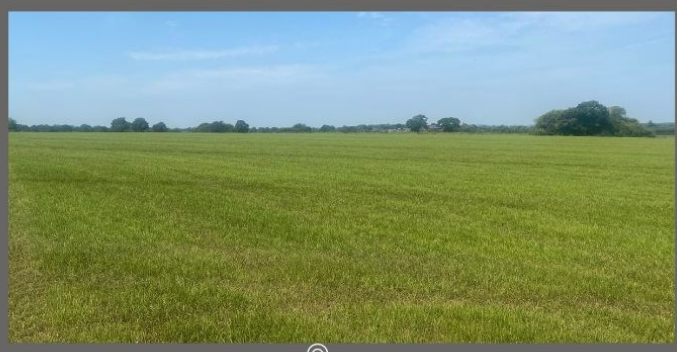
For sale as a whole or in two lots O.I.E.O £1,600,000