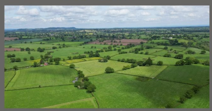
Land Malpas, Cheshire Lot I-132 Acres | Lot 2 - 34 Acres | Lot 3 - 179 Acres