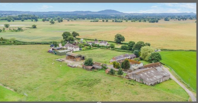
34 Acres © Telford, Shropshire Farmhouse, outbuildings, stables with potential Guide Price £1,115,000