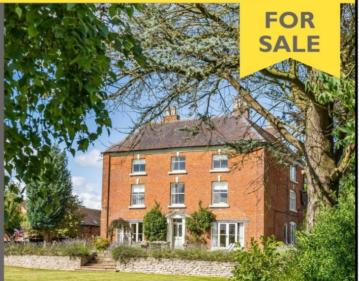
Aston Manor | Aston, Market Drayton Substantial period house with extensive gardens Guide Price £925,000

Interested? Contact Annabel or Kirsty from our property sales team on 01630 692 500 or email sales@barbers-rural.co.uk