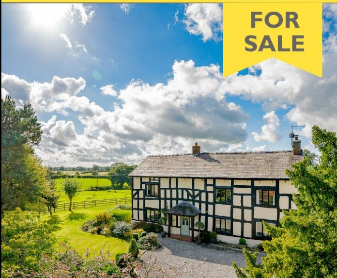
The Royals | Burleydam, Nr Whitchurch Grade II Listed Farmhouse with outbuildings O.I.E.O £720,000