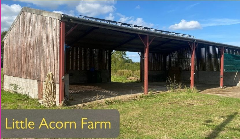
Little Acorn Farm