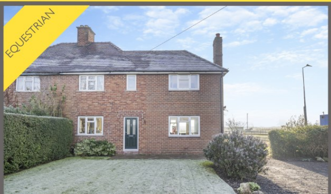
3.21 Acres (1.29 Ha) Nr Telford, Shropshire 3 bed semi-detached cottage | 6 stables & tack room hay store, concrete yard & manège | EPC E Guide Price £535,000

2.82 Acres (1.14 Ha) Nr Whitchurch, Cheshire exceptionally well-presented Grade II listed farmhouse outbuilding with potential for conversion | EPC F O.I.E.O £720,000